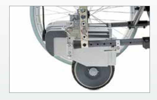
Simply place into the brackets previously mounted on the wheelchair.