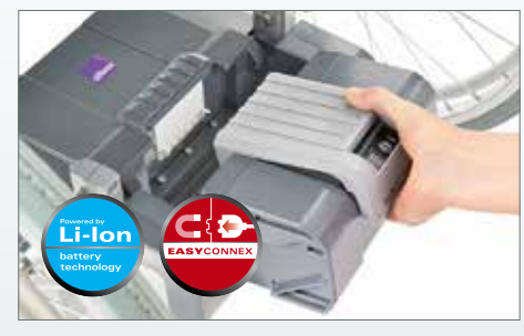
Insert the battery pack effortlessly. It's simple and safe.