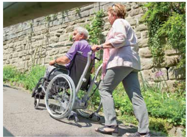
Mastering uphill inclines without any difficulty.