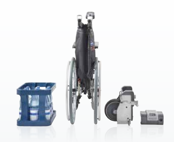
viamobil – small, light, handy and easy to transport